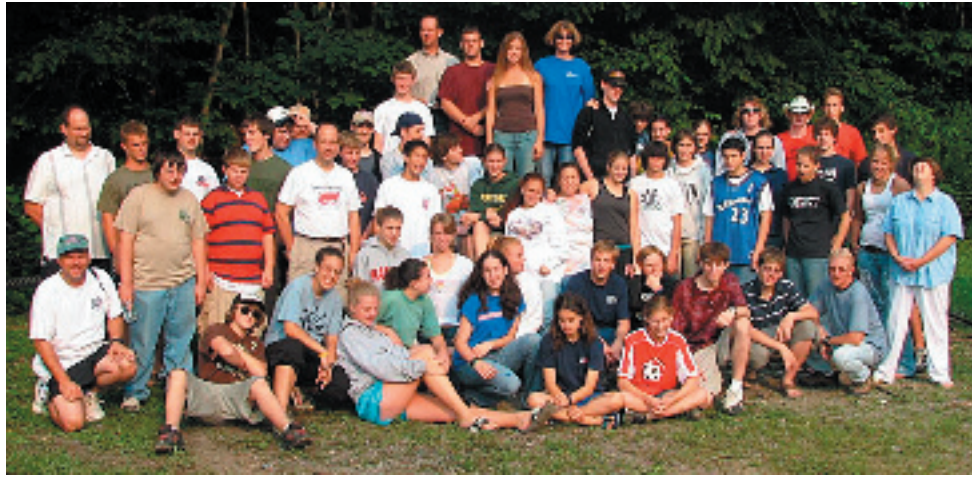
Dungannon Mission trip 2005