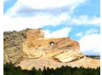
Chief Crazy Horse Memorial