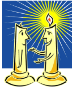
WITNESS TO OTHERS