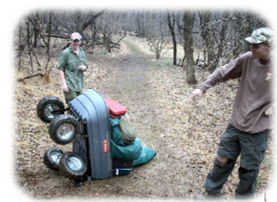
The Four-Wheeled Monster

In March Troop 159 went camping at Sky Meadows Park. The Scoutmaster chose a walk-in campsite, so we had to hike <sup>3</sup>/<sub>4</sub> of a mile, which was only grueling because of our 80+ lb. packs.