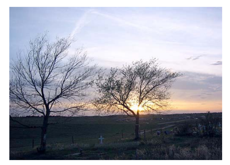
Wounded Knee at sunset