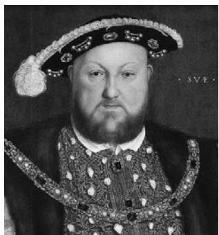
King Henry VIII broke with Rome to form the Church of England

King Henry didn't like Luther's reform movement but he wanted more control of the church in England. He, like many political leaders of his time, wanted his people's undivided loyalty, and he had other uses for the English money that supported the