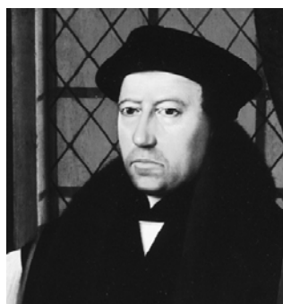
Archbishop of Canterbury Thomas Cranmer supported King Henry's reformation, and drafted the Book of Common Prayer.