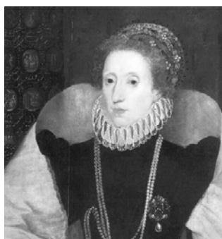
Henry's daughter, Queen Elizabeth I, helped guide the Church of England to a "middle way."

church in Rome. Henry broke from Rome, and England suffered as Roman Catholics and Protestants battled for control of the church and the government.