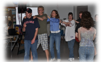
Spring Challenger Dance Pictures