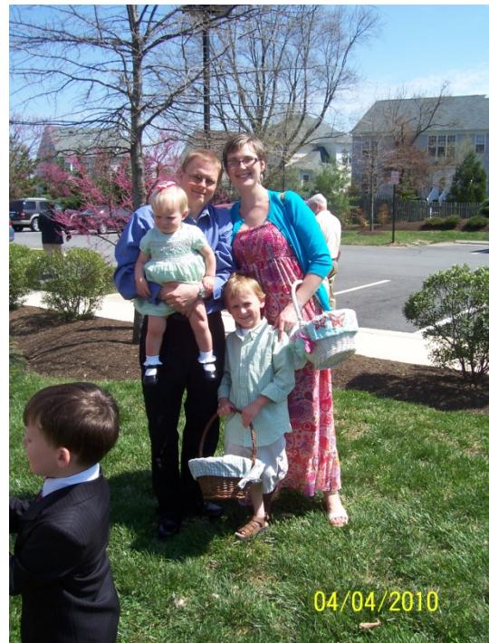
Me with my family at this year's St. Timothy's Easter Egg hunt.