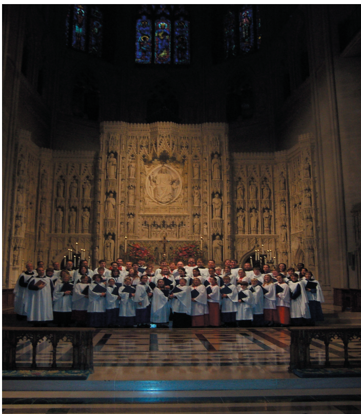
Participants of the Washington Advanced Treble Course and Voice for Life Courses in Washington National Cathedral —July 2004