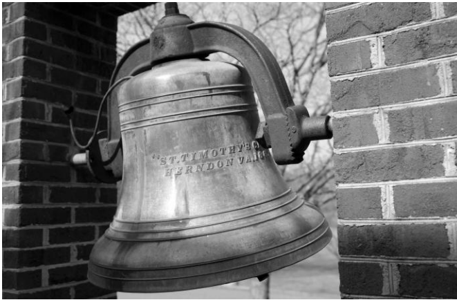
Saint Timothy's Bell ( outside of the main entrance )