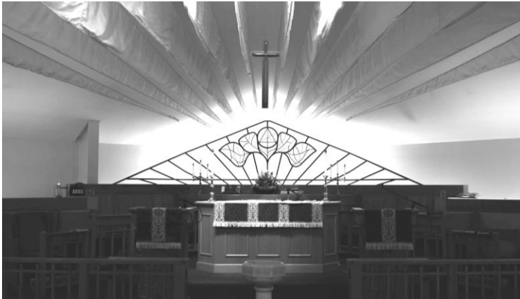
The Sanctuary Altar