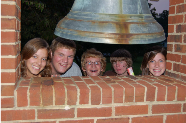
Photos of Confirmation Class