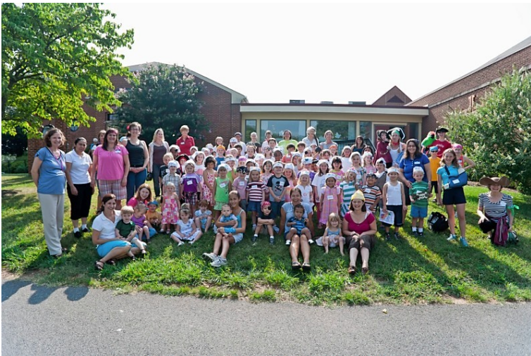
The 2010 St. Timothy's VBS