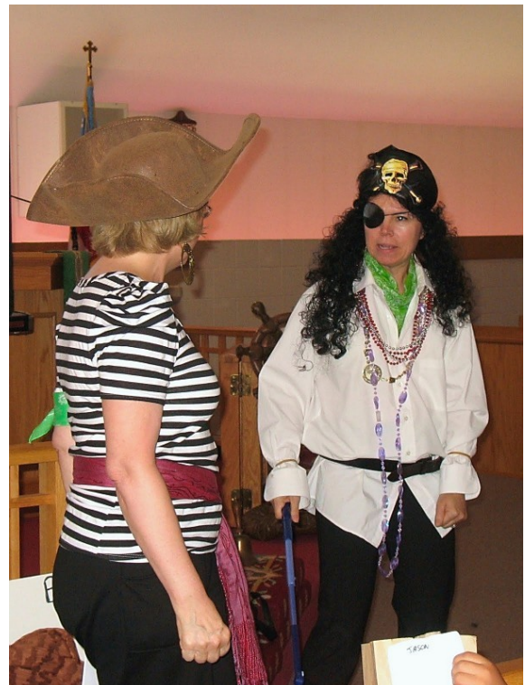
Pirates Bumbo and Bones