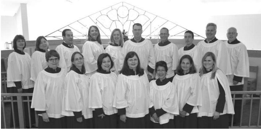
"Saint Timothy's Adult Choir (2014/2015 Choir Year)"