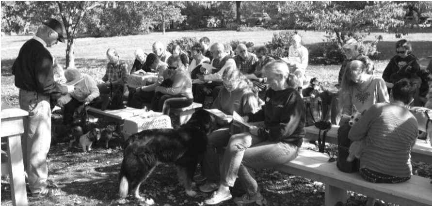
"Blessing of the Animals on Sunday, October 5 at the Outdoor Chapel!"