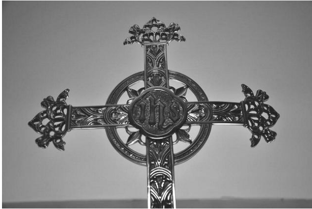
"Processional Cross"