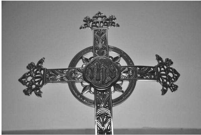
"Processional Cross"