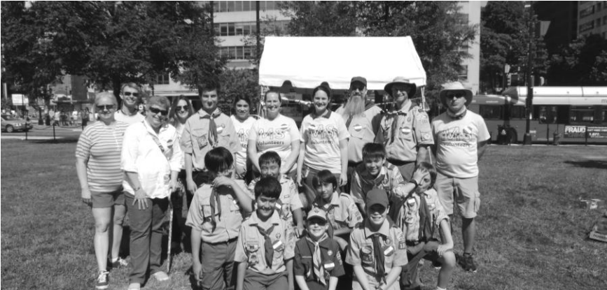
"Members of St. Tim's and our chartered Boy Scout Troop & Cub Scout Pack Volunteering at the MS Challenge Walk"