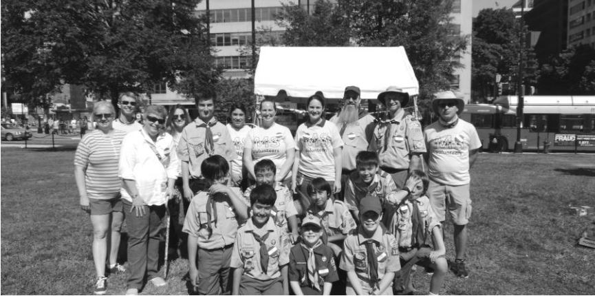
"Members of St. Tim's and our chartered Boy Scout Troop & Cub Scout Pack Volunteering at the MS Challenge Walk"