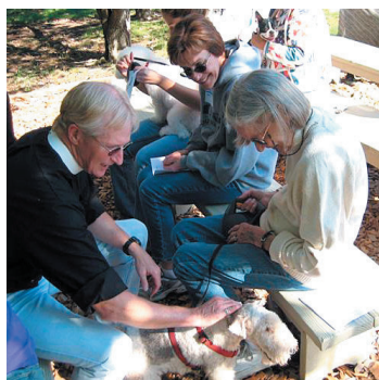
Blessing The Animals