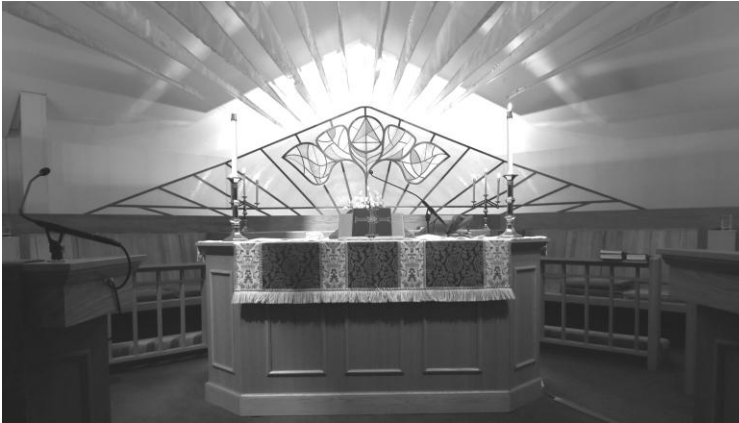
"Sanctuary Altar"