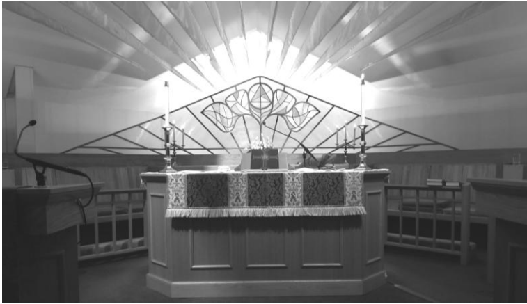
"Sanctuary Altar"