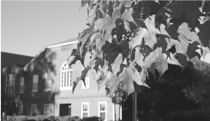
"Saint Timothy's (Spring St. Facing)"