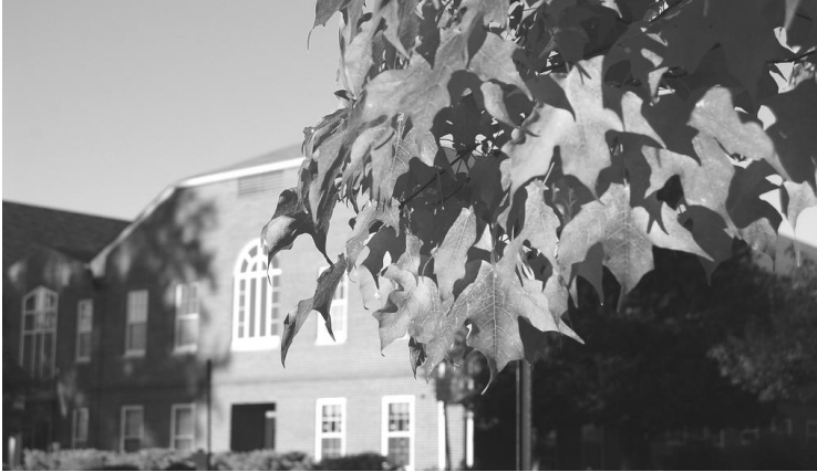
"Saint Timothy's (Spring St. Facing)"