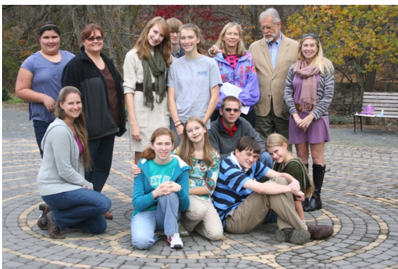
The R13/J2A crew

Service Ministry... putting your faith to work