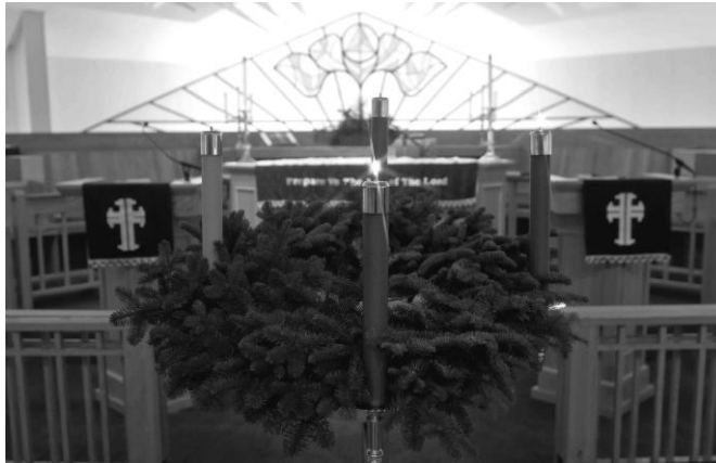
"Advent Candles"