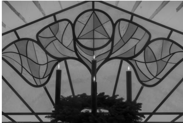
"Advent Candles"