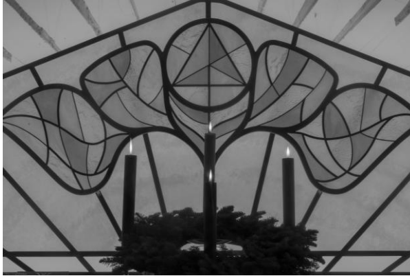
"Advent Candles"