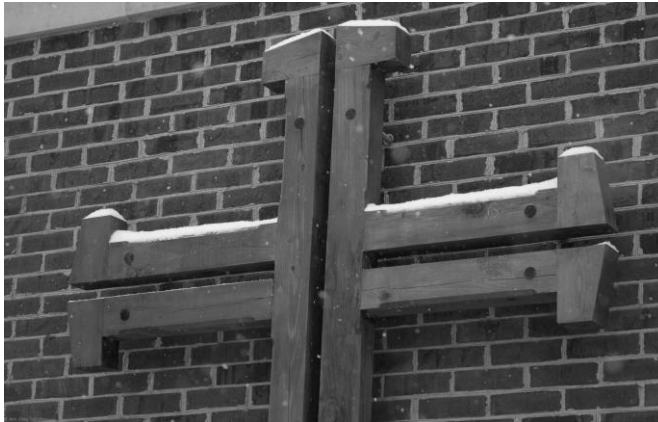
Cross on external Sanctuary Wall