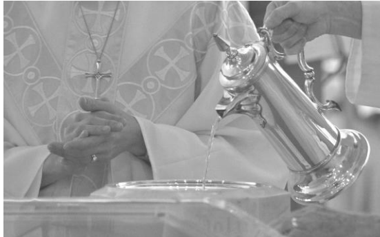
Preparing for Baptism