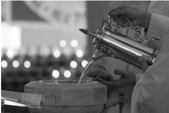
Baptismal Font