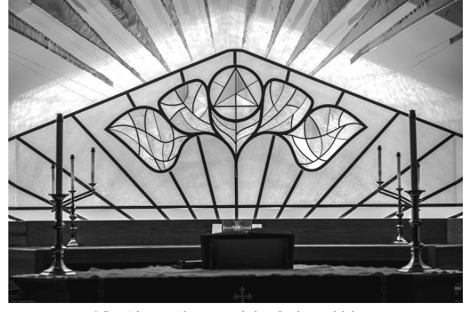
The Altar