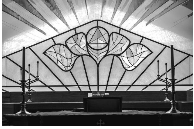
The Altar