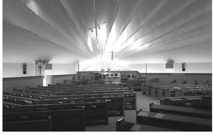
The Sanctuary