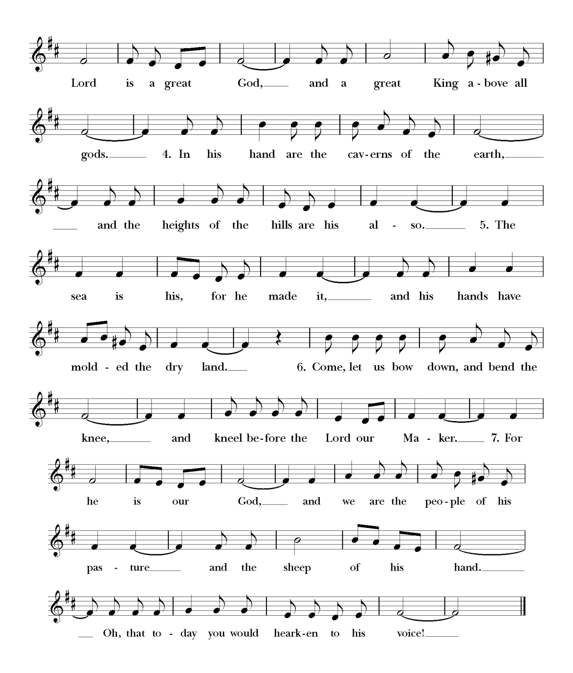
The people are seated