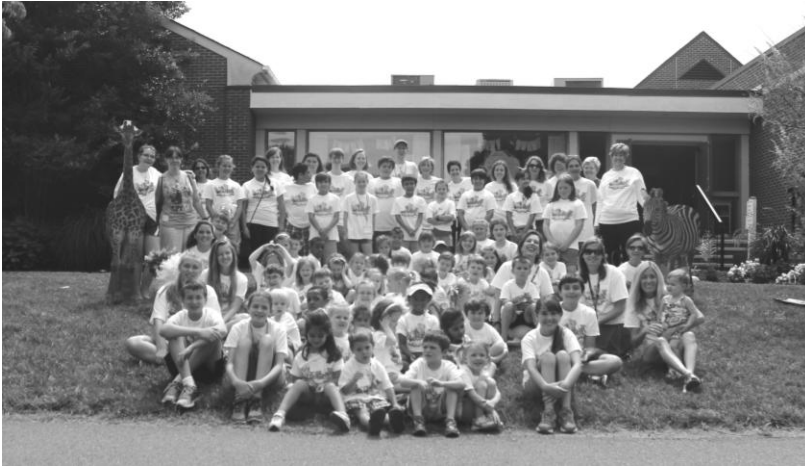
"Saint Tim's 2014 Vacation Bible School Group Picture."