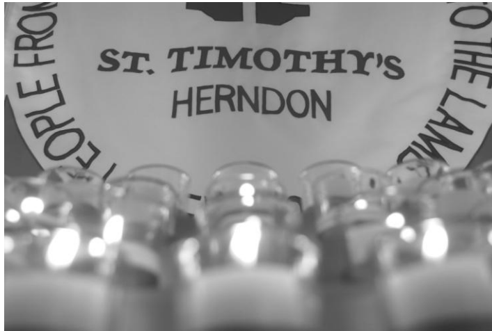
"Saint Tim's Banner behind Votive Candles."