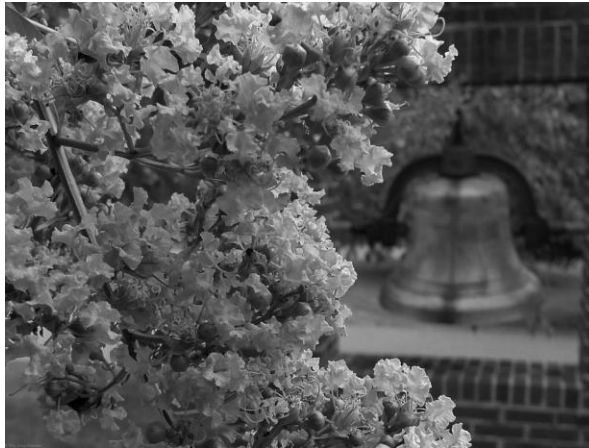
"Crepe Myrtle in bloom and exterior bell."