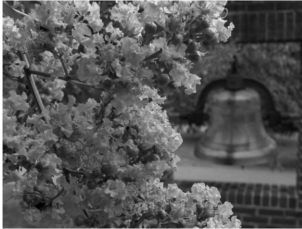
"Crepe Myrtle in bloom and exterior bell."