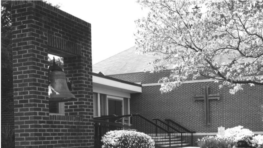
"Exterior Bell and outside wall of the Sanctuary."