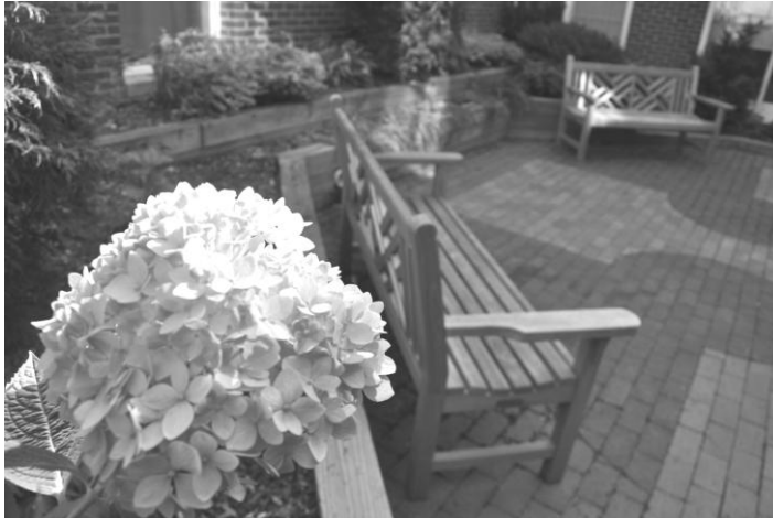
"Church Courtyard."