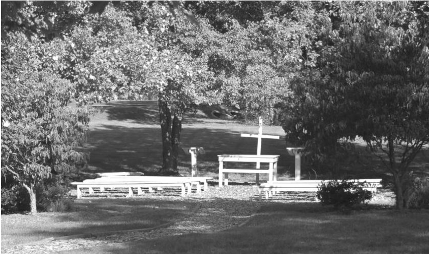
"Outdoor Chapel"