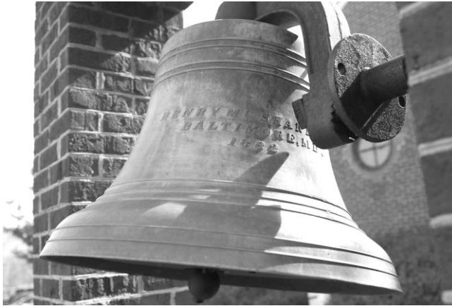
"Exterior Bell Outside of the Entrance to the Offices"