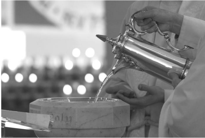
"Baptismal Font with Candles In The Background"