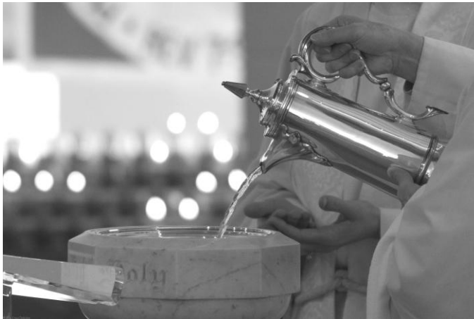
"Baptismal Font with Candles In The Background"