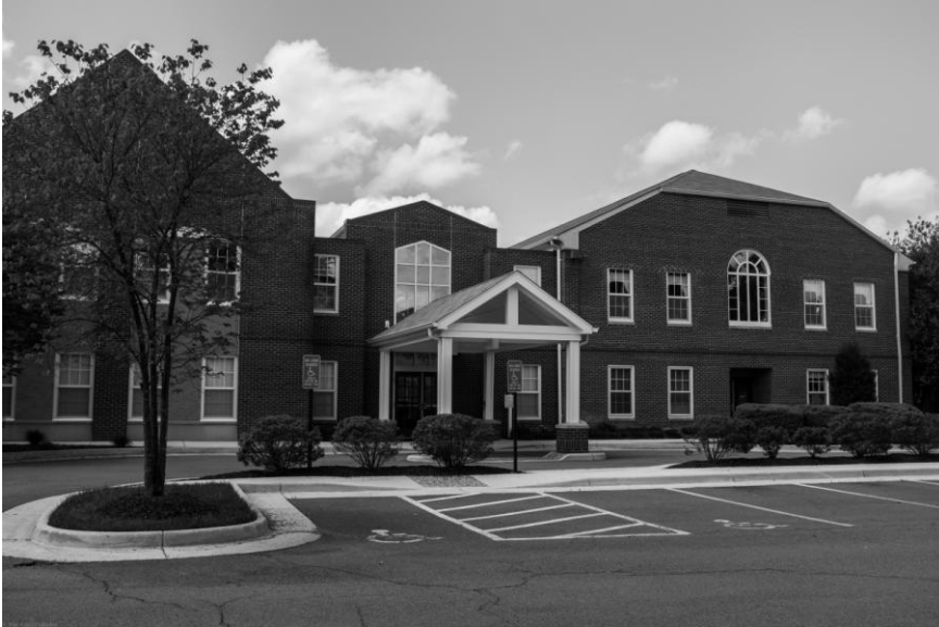
Entrance Facing Spring Street