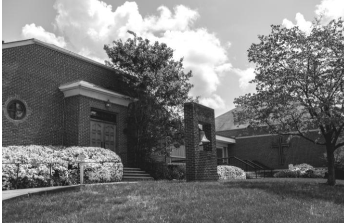
Sanctuary Entrance of the Church