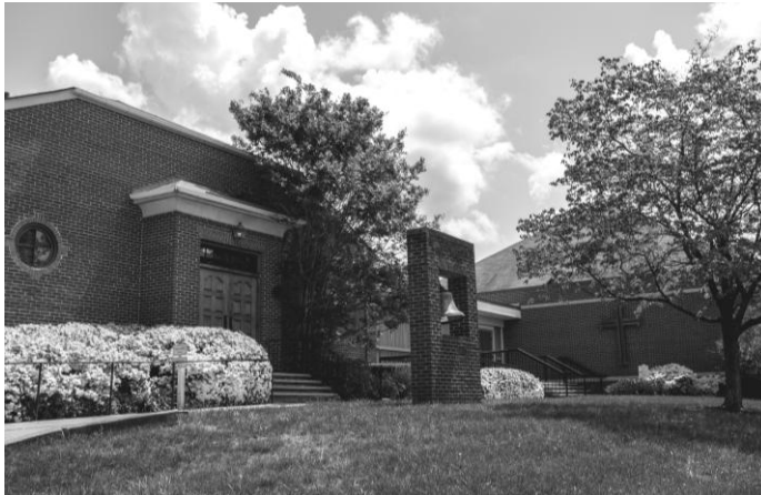
Sanctuary Entrance of the Church