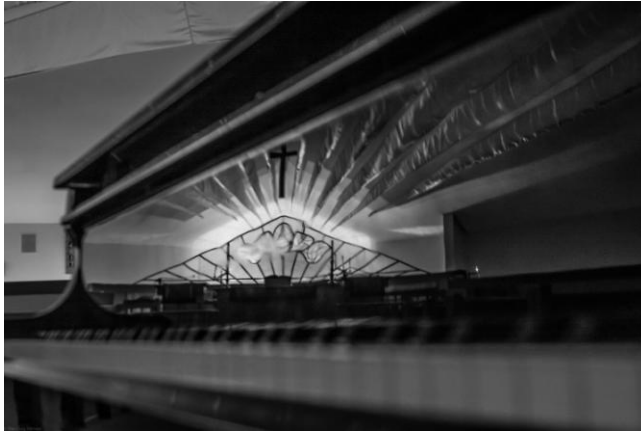
Sanctuary Altar Reflected in Piano