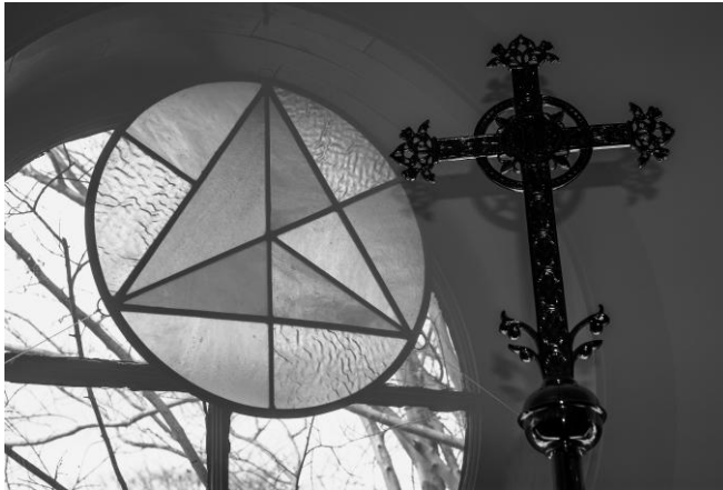
Stained Glass & Cross (Hall between Narthex & Offices)