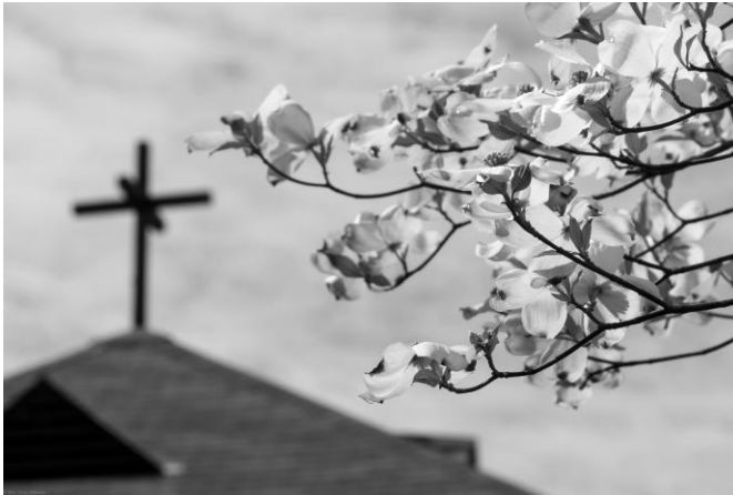
Flowering Tree / Cross on sanctuary roof.