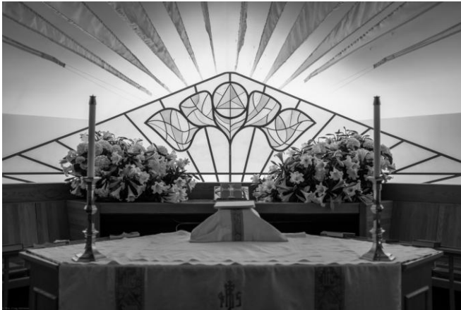
The Altar Photograph by Craig Dubishar.